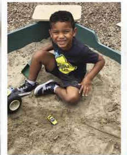
Everyone loves the sandbox!