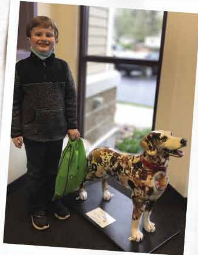
One of this year's Cavity-Free Club champs shows off his winning smile!