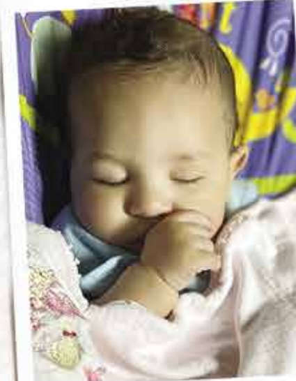
Hush little baby...