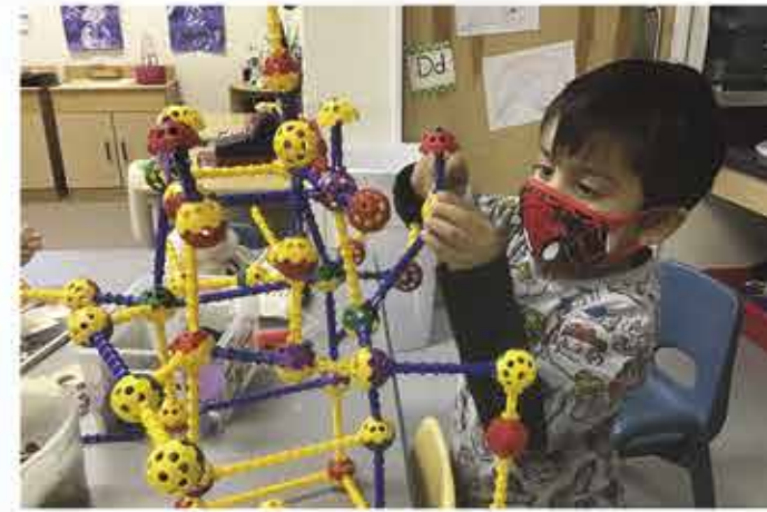
Just another day creating and refining fine motor skills!