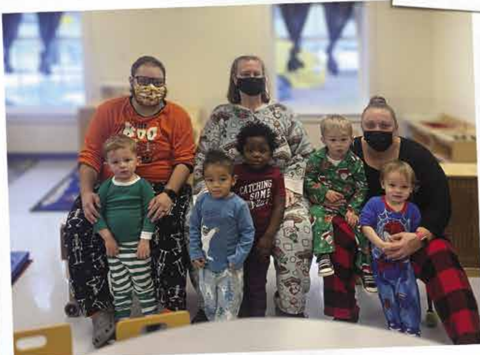
Everyone loves Pajama Day!