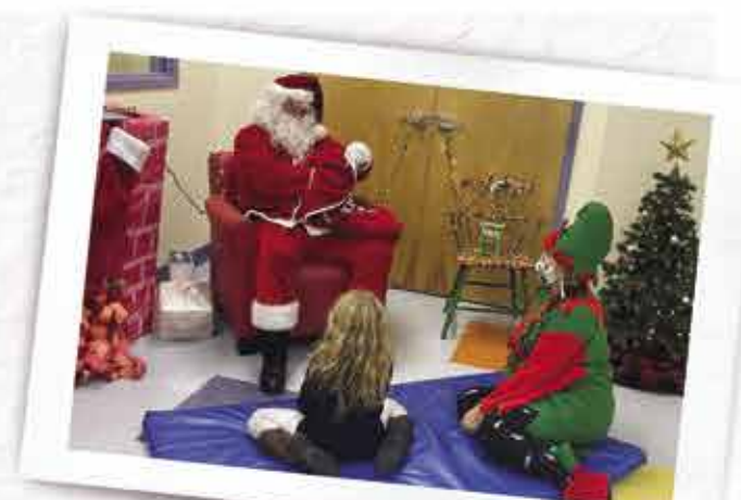
Santa visited for the Relatives as Parents holiday event.